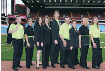
Team modelling the new uniforms

at fantastic venues across the country; Manchester United, the Emirates stadium, Aston Villa and SS Great Britain.